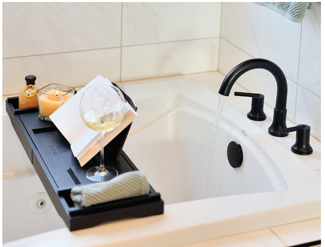
Modern black fixtures and hardware provide crisp contrast to the warm brown-gray tones in the cabinetry and tile in the primary bathroom.

68 SU CASA SUMMER 2022 SUCASAMAGAZINE.COM 69