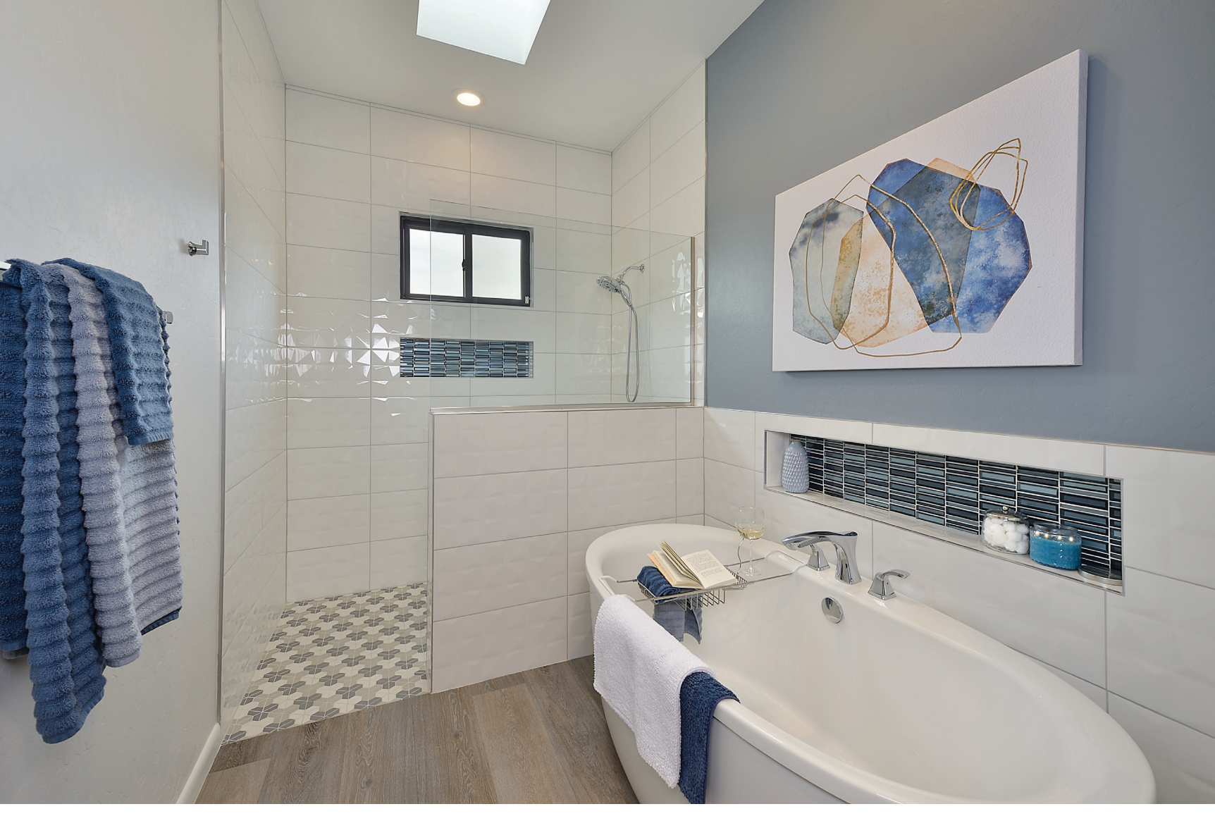
A secondary bathroom offers guests a soaking tub, separate shower and beautiful tile backsplash and niches.